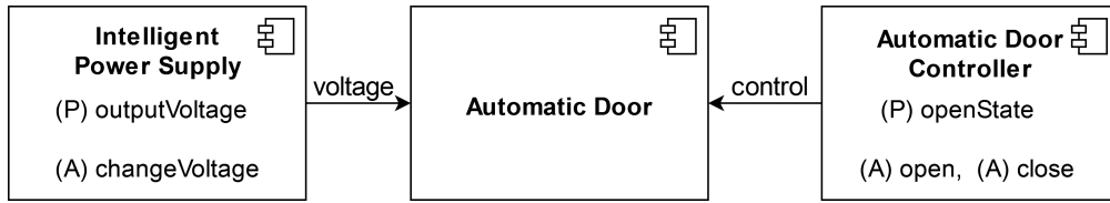
Figure 1: Example scenario of an intelligent power supply that provides different voltage levels to an automatic door and a controller capable of opening and closing the automatic door. Available properties (P) and actions (A) are shown.

The power supply has interactions that allow users to read the current voltage output and to change the voltage output by adding a value between -10 and 10 to the current value. A TD of such a power supply following the W3C TD 1.1 standard, is shown in listing 1.